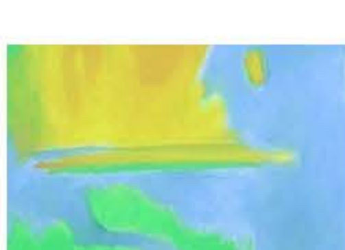
Painterly Gardens Inspire Generations of Artists