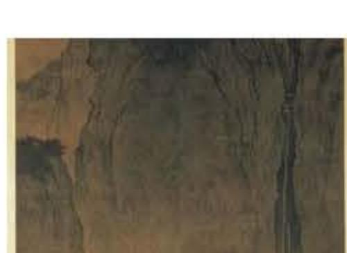
7 New Categories for You to Explore