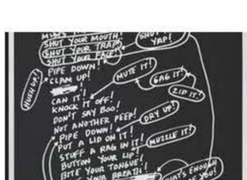
Room for Misinterpretation in the Works of Mel Bochner