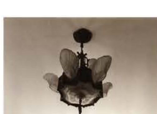
Happenings: Top Art News, from Gallery Weekend Berlin to Rhizome's Seven on Seven