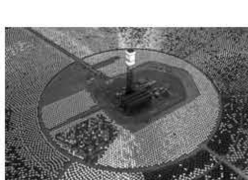
The Sublime, Surprising Beauty of the World's Largest Solar Power Plant